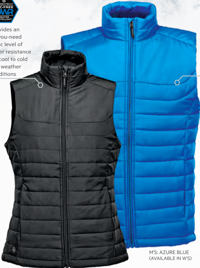
W'S: BLACK (AVAILABLE IN M'S)

Provides an all-you-need basic level of water resistance for cool to cold wet weather conditions