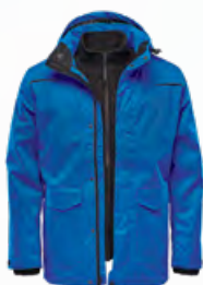
M'S: MARINE BLUE LINER: BLACK