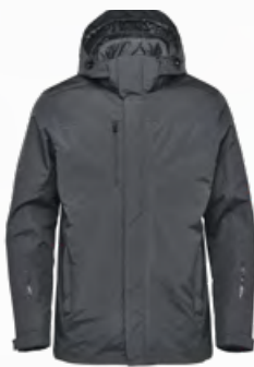
M'S & W'S: GRAPHITE LINER: GRAPHITE