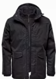
M'S, W'S & Y'S: BLACK LINER: BLACK