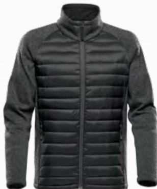
M'S & W'S: BLACK/DOLPHIN HEATHER