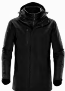
M'S & W'S: BLACK LINER: BLACK