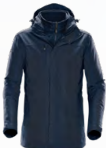
M'S & W'S: NAVY TWILL LINER: NAVY