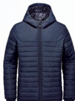
M'S & W'S: NAVY