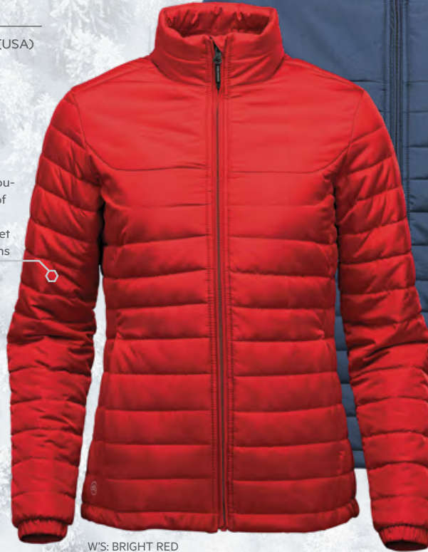
W'S: BRIGHT RED (AVAILABLE IN M'S)