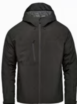
M'S & W'S: BLACK/GRAPHITE

FABRICATION: (Shell) 100% Polyester Mechanical Stretch, 3.57 oz/yd 2 (USA) / 120gsm (CDN); (Lining) 100% Nylon Taffeta