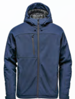
M'S & W'S: NAVY/GRANITE