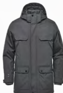
M'S & W'S: GRAPHITE LINER: GRAPHITE