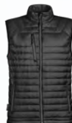
M'S & W'S: BLACK/ CHARCOAL