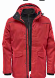
M'S & W'S: RED LINER: BLACK