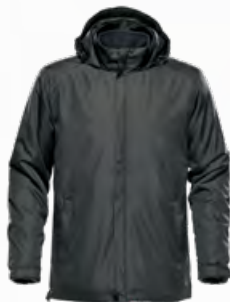
M'S & W'S: DOLPHIN LINER: DOLPHIN