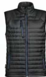
M'S & W'S: BLACK/ MARINE BLUE