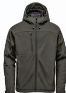
M'S & W'S: GRANITE/BLACK