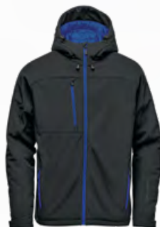
M'S & W'S: BLACK/AZURE BLUE