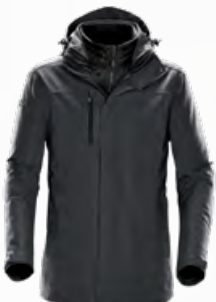
M'S & W'S: CHARCOAL TWILL LINER: BLACK