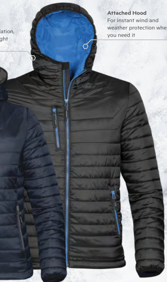
M'S: BLACK/MARINE BLUE (AVAILABLE IN W'S)