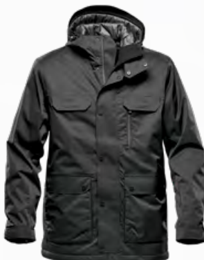
M'S & W'S: CHARCOAL