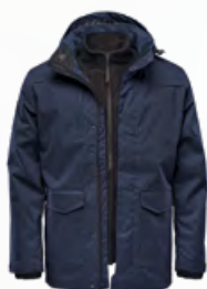
M'S, W'S & Y'S: NAVY LINER: BLACK