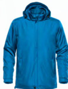
M'S & W'S: AZURE BLUE LINER: AZURE BLUE