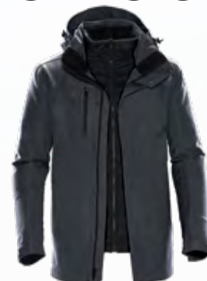
ZIP-IN/ ZIP-OUT LINER