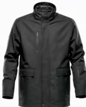
M'S & W'S: BLACK LINER: BLACK