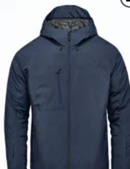
M'S & W'S: NAVY/GRAPHITE