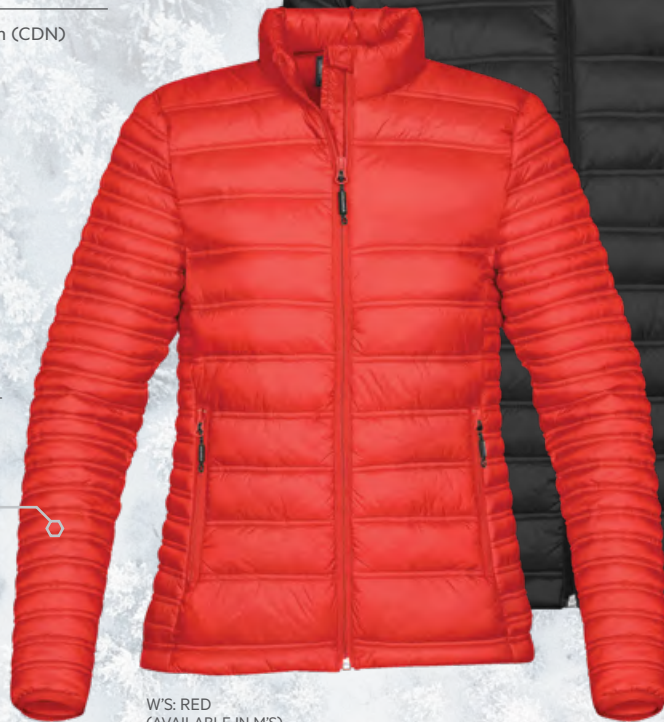
W'S: RED (AVAILABLE IN M'S)