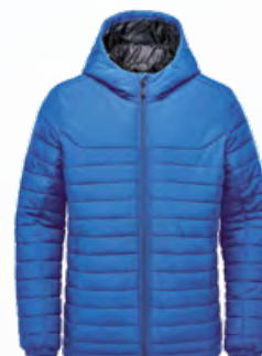
M'S & W'S: AZURE BLUE