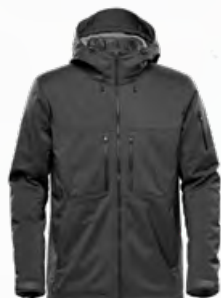
M'S & W'S: CHARCOAL TWILL LINER: BLACK