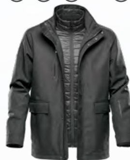
ZIP-IN/ ZIP-OUT LINER