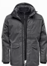
M'S & W'S: GRANITE LINER: BLACK