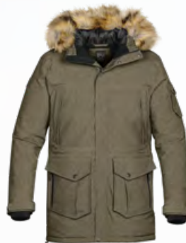
M'S: SAGE HEATHER