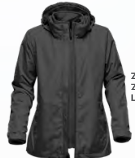
ZIP-IN/ ZIP-OUT LINER