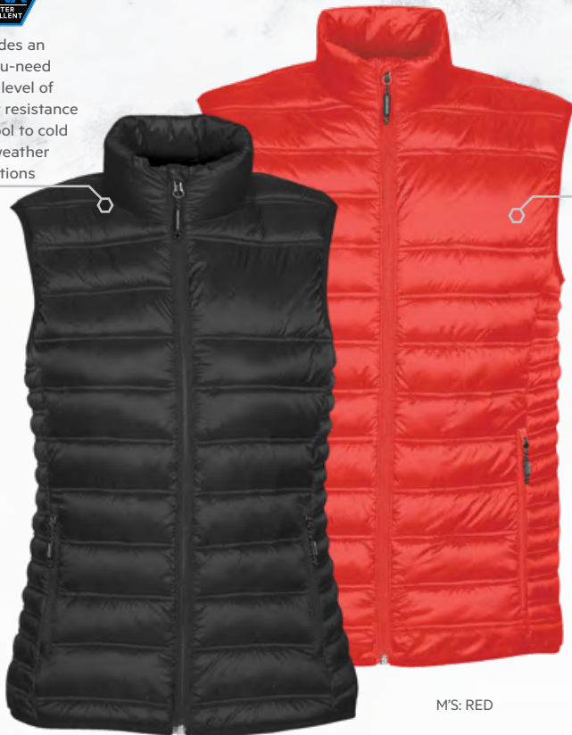
W'S: BLACK (AVAILABLE IN M'S)

Provides an all-you-need basic level of water resistance for cool to cold wet weather conditions