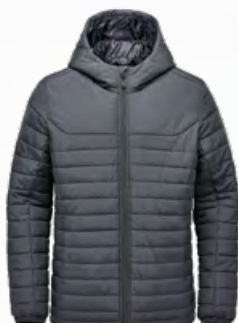
M'S & W'S: DOLPHIN