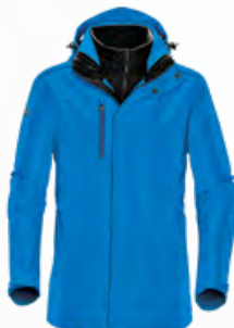
M'S & W'S: MARINE BLUE LINER: BLACK