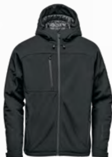
M'S & W'S: BLACK/GRANITE