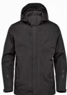
M'S & W'S: BLACK LINER: BLACK