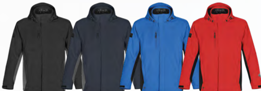
M'S & W'S: BLACK/GRANITE LINER: BLACK

OUTER SHELL LINER (E) (HT) (LP) (E) (SP) (LP)