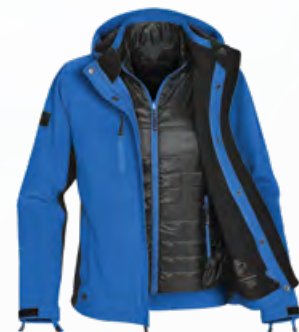
ZIP-IN/ ZIP-OUT LINER