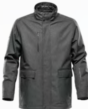
M'S & W'S: GRAPHITE HEATHER LINER: BLACK