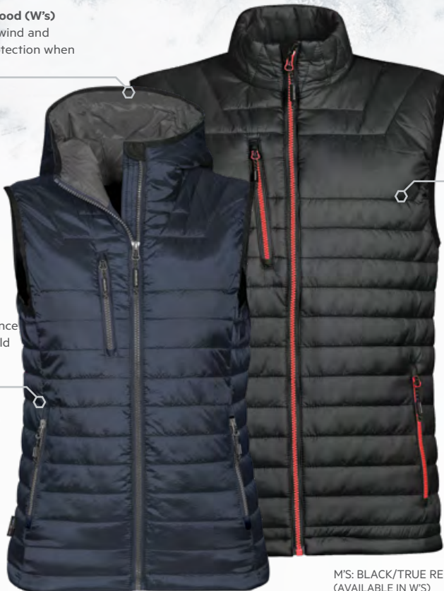
M'S: BLACK/TRUE RED (AVAILABLE IN W'S)

High loft synthetic insulation, designed to be lightweight and compactible