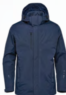
M'S & W'S: NAVY LINER: NAVY