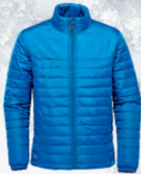
M'S & W'S: AZURE BLUE