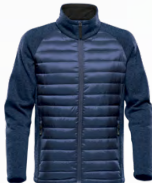
M'S & W'S: INDIGO/INDIGO HEATHER