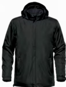
M'S & W'S: BLACK LINER: BLACK