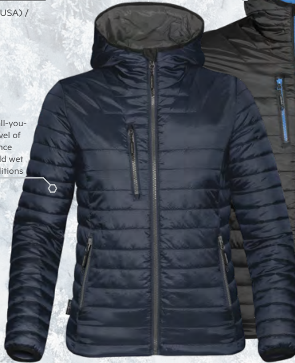
W'S: NAVY/CHARCOAL (AVAILABLE IN M'S)