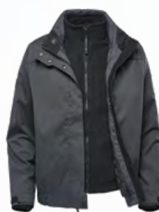
W'S: GRANITE LINER: BLACK