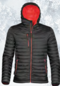
M'S & W'S: BLACK/ TRUE RED