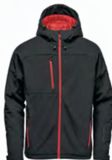
M'S & W'S: BLACK/RED