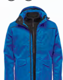
ZIP-IN/ ZIP-OUT LINER