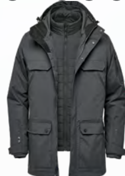
ZIP-IN/ ZIP-OUT LINER