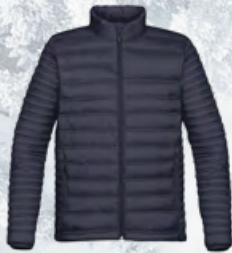
M'S & W'S: NAVY

Provides an all-you-need basic level of water resistance for cool to cold wet weather conditions