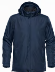
M'S & W'S: NAVY LINER: NAVY