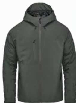
M'S & W'S: GRAPHITE/BLACK