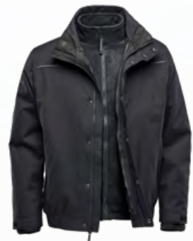
ZIP-IN/ ZIP-OUT LINER