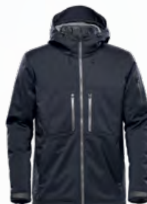
M'S & W'S: NAVY LINER: NAVY