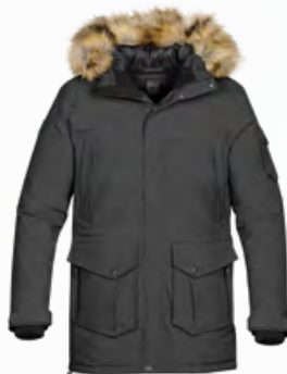
M'S & W'S: CARBON HEATHER