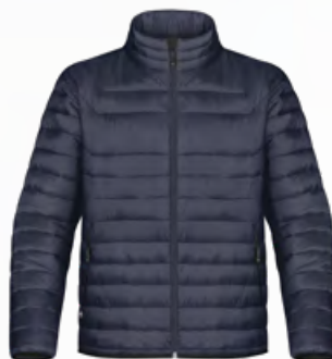
M'S & W'S: NAVY