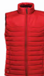
M'S & W'S: BRIGHT RED