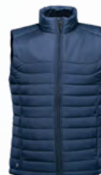
M'S & W'S: NAVY