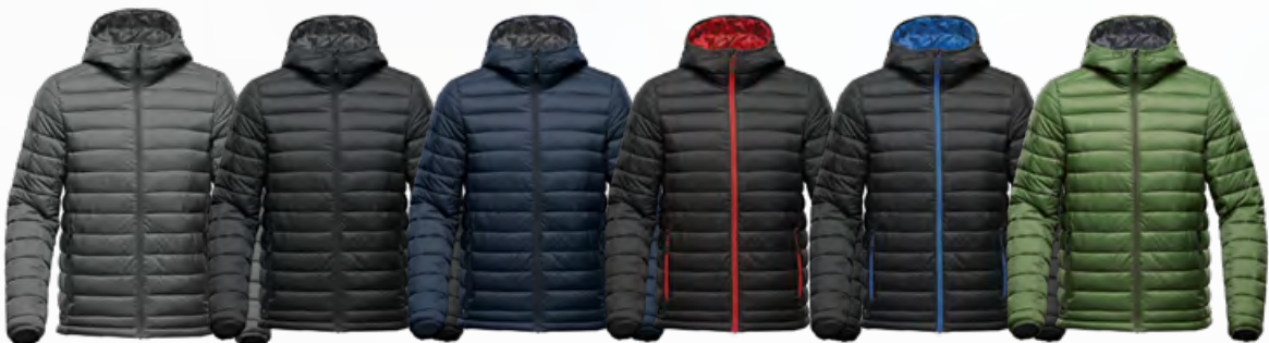
M'S & W'S: GRAPHITE/ GRAPHITE