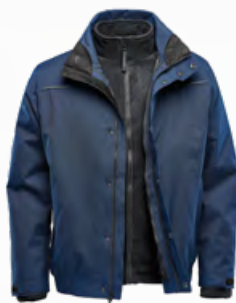
M'S & W'S: NAVY LINER: BLACK