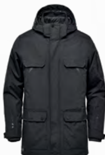
M'S & W'S: BLACK LINER: BLACK