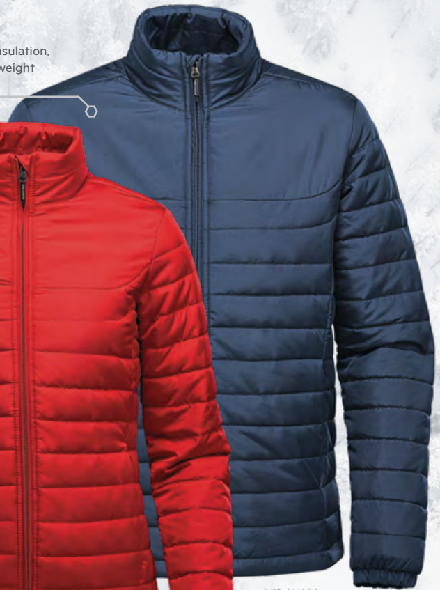
M'S: NAVY (AVAILABLE IN W'S)