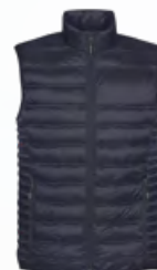
M'S & W'S: NAVY