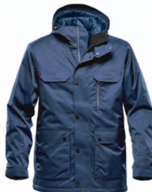
M'S & W'S: INDIGO