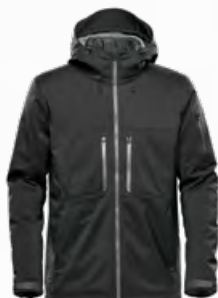
M'S & W'S: BLACK LINER: BLACK