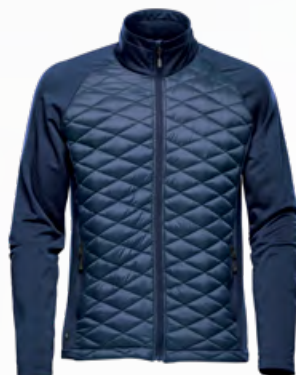
M'S & W'S: INDIGO