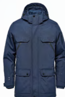
M'S & W'S: NAVY LINER: NAVY