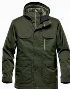
M'S & W'S: MOSS