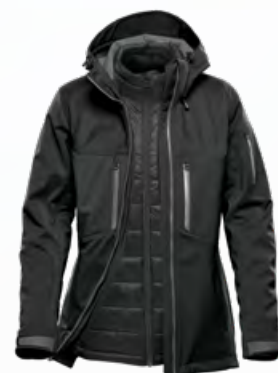
ZIP-IN/ ZIP-OUT LINER