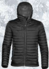
M'S & W'S: BLACK/ CHARCOAL

For instant wind and weather protection when you need it